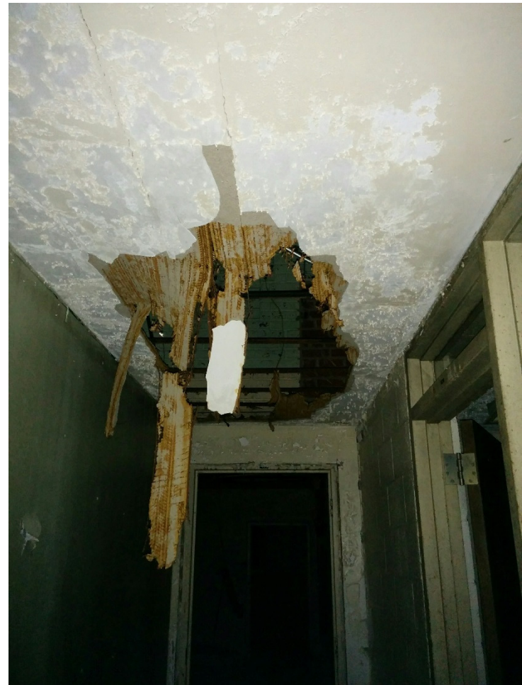
Photos 1 & 2. Evidence of deteriorating ceiling and falling debris in Building No. 2. Source: DPH, October 25, 2016.