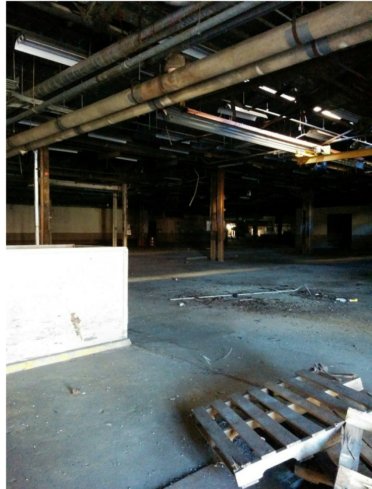
Photo 5 (left). Collapsing interior wall on Building No. 4. Source: DPH, October 25, 2016.